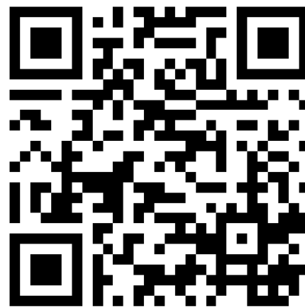
Read a good classic book!

In addition to using QR codes to link to websites, you can also create ones that store text: not SMS text messages, but plain text, as in a birthday message or poem.