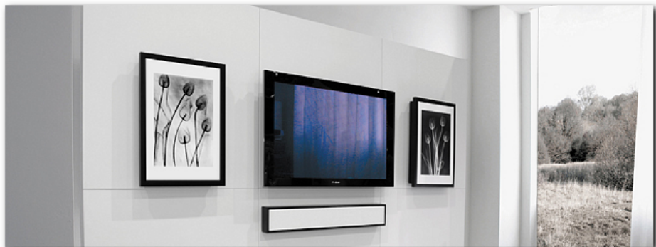
ARTCOUSTIC Loudspeakers ... Very Expensive ...