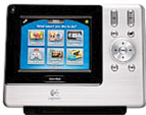
A TouchScreen Universal Remote Control $500