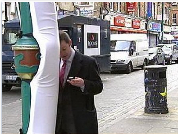
"People Safe" Poles