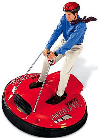
The "HOVER SCOOTER" TOY ... $17,000