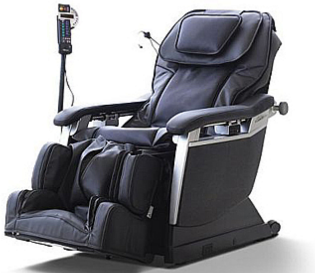
Massage Recliner with Voice-Activated System $6000