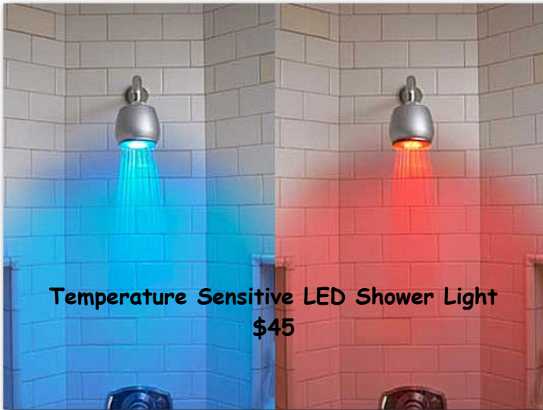
Temperature Sensitive LED Shower Light $45