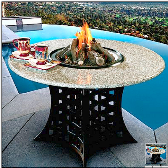
Portable "Gas Fire Logs" Only $2200