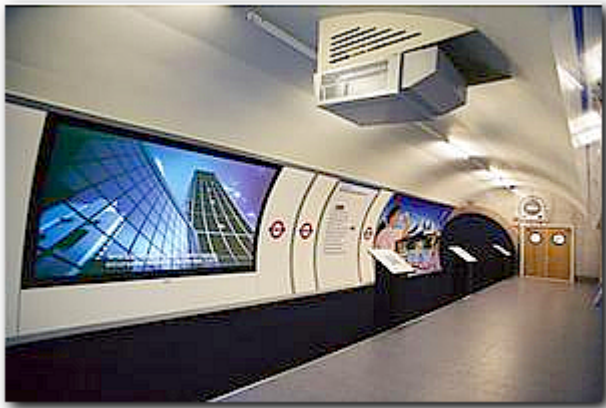
More Visual Clutter