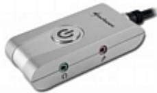
A "REMOTE" COMPUTER Power Switch