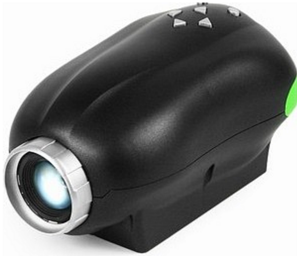
Micro SD Card Projector