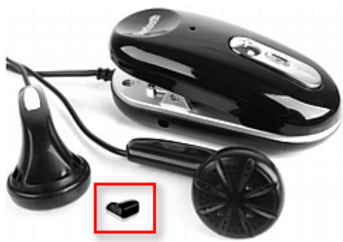
A Bluetooth mike (in a Tooth)