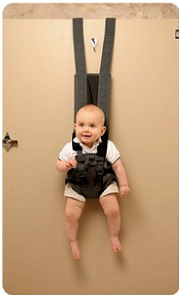
A "BABY" HANGER