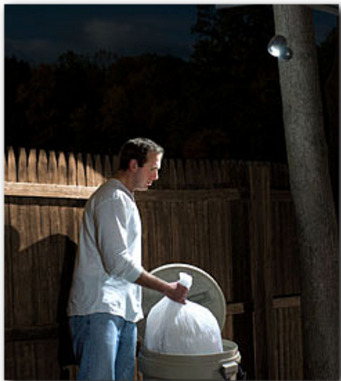
Motion-Sensor LED Spotlight .. Uses 3 D Batteries