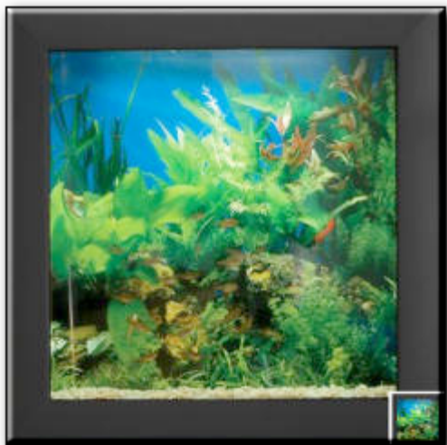
Wall Mounted Aquarium .. 6 \frac{1}{2} Gallons